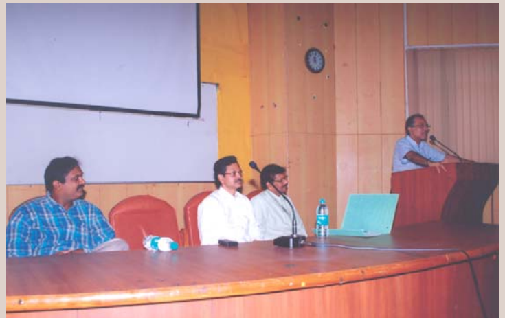
Vice Chancellor, UoH inaugurating the PG Diploma Business Management Programme