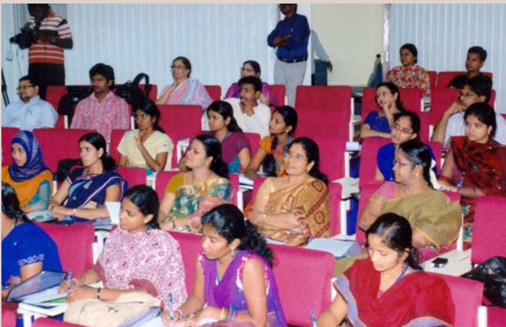
Participants in the one day Seminar on "Criminal Justice System in India : Basic Functionaries & Procedures"