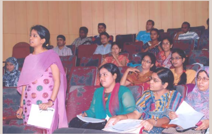
Students during the contact programme of PG Diploma in Business Management