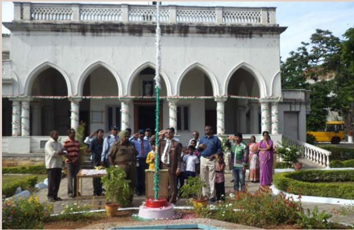
Independence day celebrations at Golden Threshold Campus, UoH