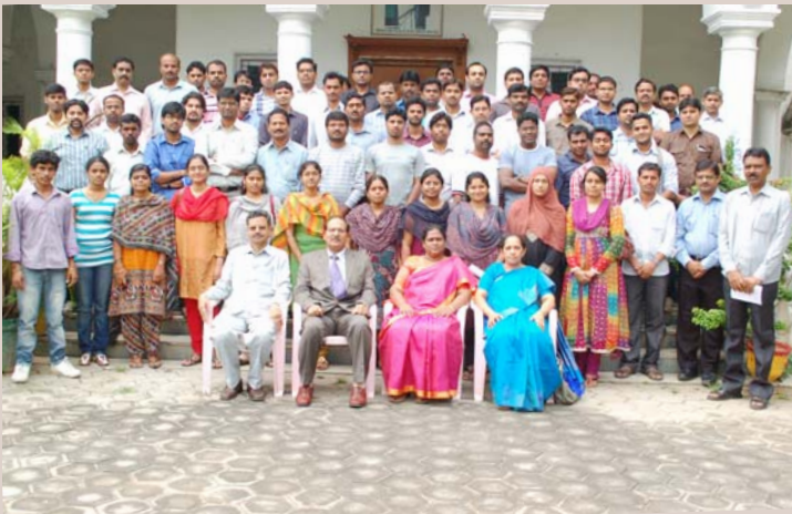
Participants of PG Diploma in Project Management