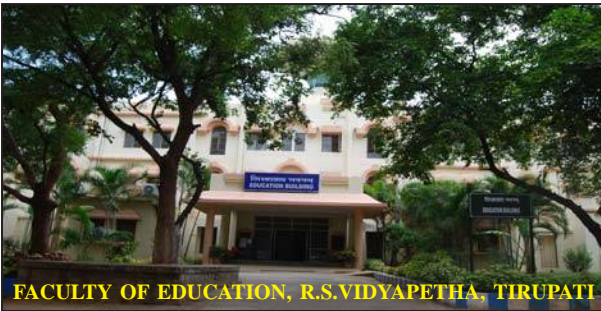
FACULTY OF EDUCATION, R.S.VIDYAPEETHA, TIRUPATI